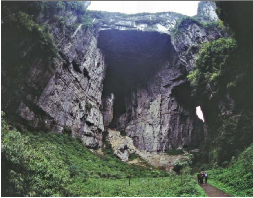
Fig. 2. View along the floor of the Qinlong Tiankeng, towards the natural bridge at its western end, in the Wulong Sanqiao Park.