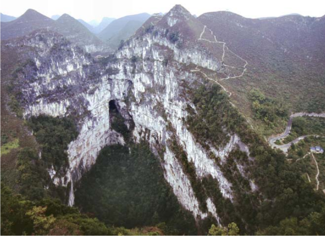
Fig. 5. Dashiwei Tiankeng, in the Leye karst, with some scale given by the road on the right.