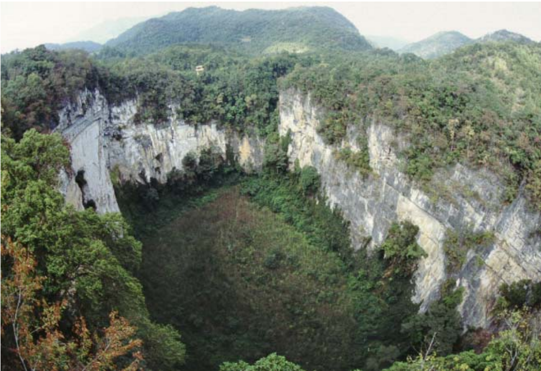
Fig. 6. Huangjing Tiankeng, with its perimeter cliffs all over 120 m high.

Wednesday was another grey morning, for a visit to Huangjing Tiankeng. Though only 160 m deep, this is a beautiful sight, with a flat floor inside a circle of vertical perimeter cliffs over 200 m across (Fig. 6). The cliffs are all limestone but the tiankeng has breached the feather edge of a sandstone caprock that supports stream channels