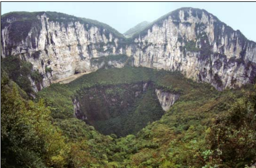
Fig. 3. Xiaozhai Tiankeng seen from the southern rim; the path down the stone steps is obscured by trees and shrubs - it curves round to the right and descends the steep debris fan inside the lower pit.

On Thursday morning, a string of 4WD cars took the group up to Houping, where the mountains were shrouded in cloud but were largely of sandstone that caps the limestone. At the end of a very muddy road, a short walk across the fields led to a cliff edge where a bamboo viewing platform had been specially built for the group's visit. It overlooked the huge Qingkou Tiankeng - which was unfortunately lost in thick cloud. A further drive on muddy tracks then took the group to a fire-cracker welcome at the tiny village in front of the entrance of Erwan Dong, part of the large cave system being mapped by the Hong Meigui Cave Exploration Society. The guides in the cave were Erin Lynch (who had taken time off from her current Hong