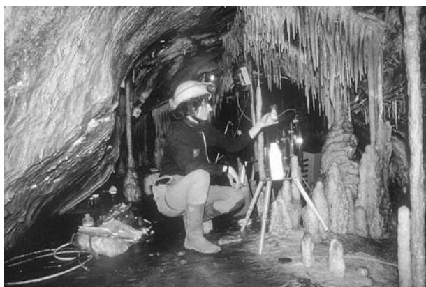
Fig. 2. In-situ measurement and sampling in the Père Noël cave.

the water residence time in the vadose zone, linked to changes in amount of precipitation. These studies demonstrated that the changes in chemistry of cave waters, and consequently in speleothems, could reflect changes in effective precipitation (or recharge) (Roberts et al., 1998; Fairchild et al., 1999, 2000; Verheyden et al., 2000). Incongruent dolomite dissolution was also demonstrated to be responsible for the anti-correlation between Mg and Sr content and between Ba and Mg content in a New Zealand flowstone by Hellstrom et al. (2000). Changes in the contribution of weathering linked with changes in rainfall intensity were invoked to explain changes in the Sr, Ba and U contents of speleothems by Bar-Matthews et al. (1999) and Ayalon et al. (1999). During colder and dryer periods, higher trace element concentrations reflect an increase in exogenic sources (sea spray and Aeolian dusts), and a reduced contribution of weathering from the host dolomites.