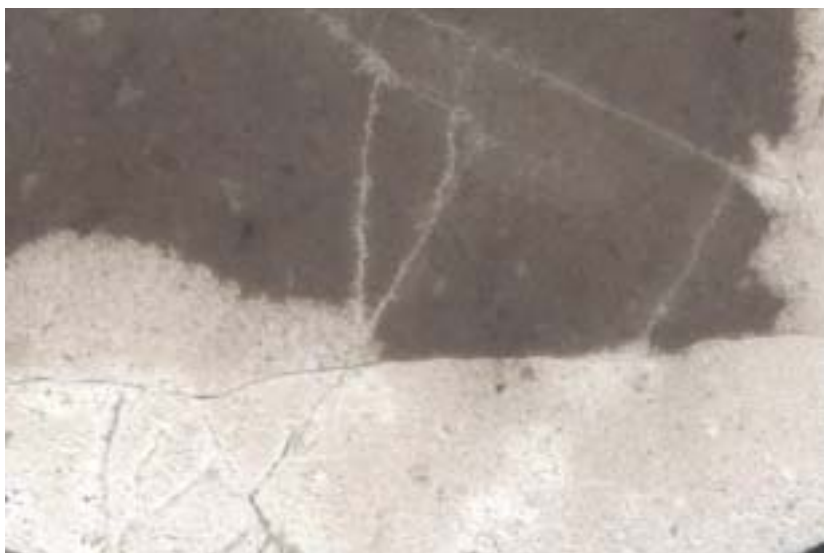
Fig. 4. Progressing of dissolution is faster along open fissures and it is stopped by calcite veins. Paleocene limestone from Jama II na Prevali. Width of the sample is 2,5 cm.

The mineral composition of the fresh or weathered parts of carbonate rock does not differ significantly. The amount of insoluble residue is sometimes higher in the weathered and sometimes in the fresh part. The conclusion one may draw from the analyses is that limestones and dolomites in the course of weathering become purer and simultaneously lose their mechanical solidity. By means of mineralogical investigation of the clastic allochthonous sediments I discovered that they do not react chemically with the weathered rock; however they do contribute the moisture required for dissolution. Yet, we do not know whether the deposited sediment might have contained minerals, which would chemically react with the rock on the passage wall and which are not present any more.