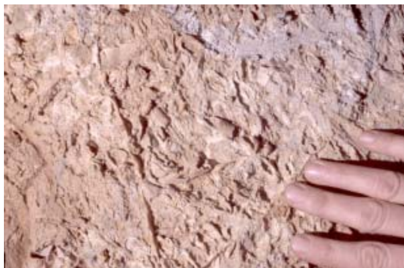
Fig. 3. Weathered shells in Upper Cretaceous limestone, from Pečina v Borštu, SW Slovenia.

Chemical analysis results demonstrated that the amount of Mg, Sr and U in the weathered zone of carbonate rock consistently decreases with weathering. Thus it became evident that during the weathering they are actually disappearing. Mg is leached from the calcite as well as from the dolomite crystal lattice. To where and in what manner remains unknown to me.