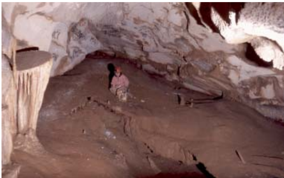
Fig. 1. Weathered cave walls in Martinska jama, SW of Slovenia. Cave was formed in Cretaceous limestone.

structuring and the extent of destruction (Slabe 1999). The processes of chemical reaction between carbonate rock and deposited sediment was described by Renault (1968), who stated that the acid saturated clay in contact with the dolomite absorbs Ca^{2+} from it and that dolomite thus becomes soft.